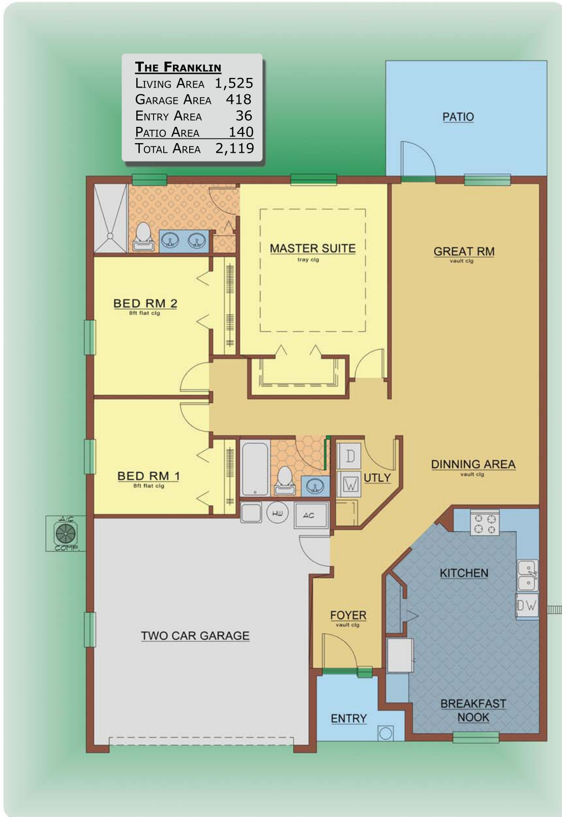
RIGHT SIDE FLOOR PLAN SHOWN LEFT SIDE MIRROR IMAGE